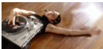
Spinvolver 2002