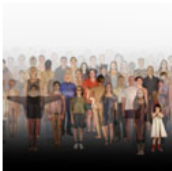
crowd of souls 2001 (detail)

It is fortunate that the Governor General should recognize achievements in the 'media arts.' For it is only a term as open-ended in its compass as 'media' that could possibly serve to embrace the wildly multifarious yet utterly particular art of John Oswald . 'Media' is plural, denoting more than one medium. And a medium, in its most basic sense, is a means, any means, of effecting or conveying something, anything. Medium is also a poetically apt word to invoke in the case of John Oswald, as it is directly derived from the Latin word meaning 'the one in the middle.' Oswald throws himself into the middle, or, more correctly, many, many middles. His voracious creative imagination stalks the areas in between traditional cultural categories. However, the aim of this in-betweenness is not to create work that is somehow outside of, or separate from, the kinds of activities these categories usually suggest. On the contrary, Oswald's art is radically inclusive. As he says: "I acknowledge categories mainly as traditional distinctions, ripe with opportunity for bridging in unique ways." Or, as he put it in a recent interview: "I'm sometimes told that this or that thing of mine seems to fall between the cracks of categorization. I'm not very sympathetic to this notion. I think these bridges I'm trying to build are, in fact, intended to span those cracks."